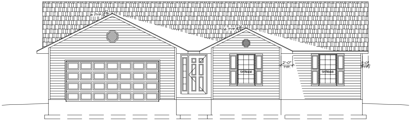
1 FRONT ELEVATION A-1 SCALE: 1/4"=1'-0"